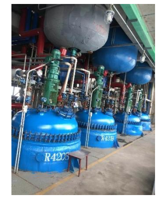
o-Cresol derivatives manufacturing equipment at Wuhai manufacturing plant