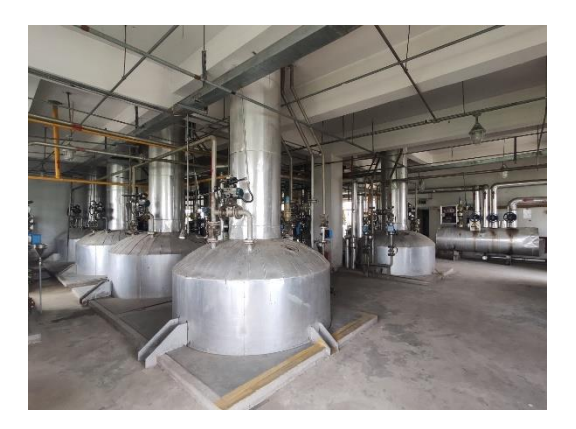
Alkylhydroxylamine manufacturing equipment at Chuzhou manufacturing plant